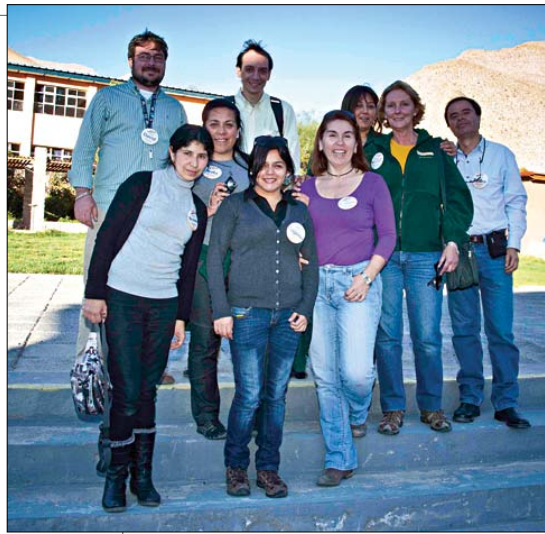
(Top left): Participants of all ages took part in FamilyAstro activities at Colegio Christ school.