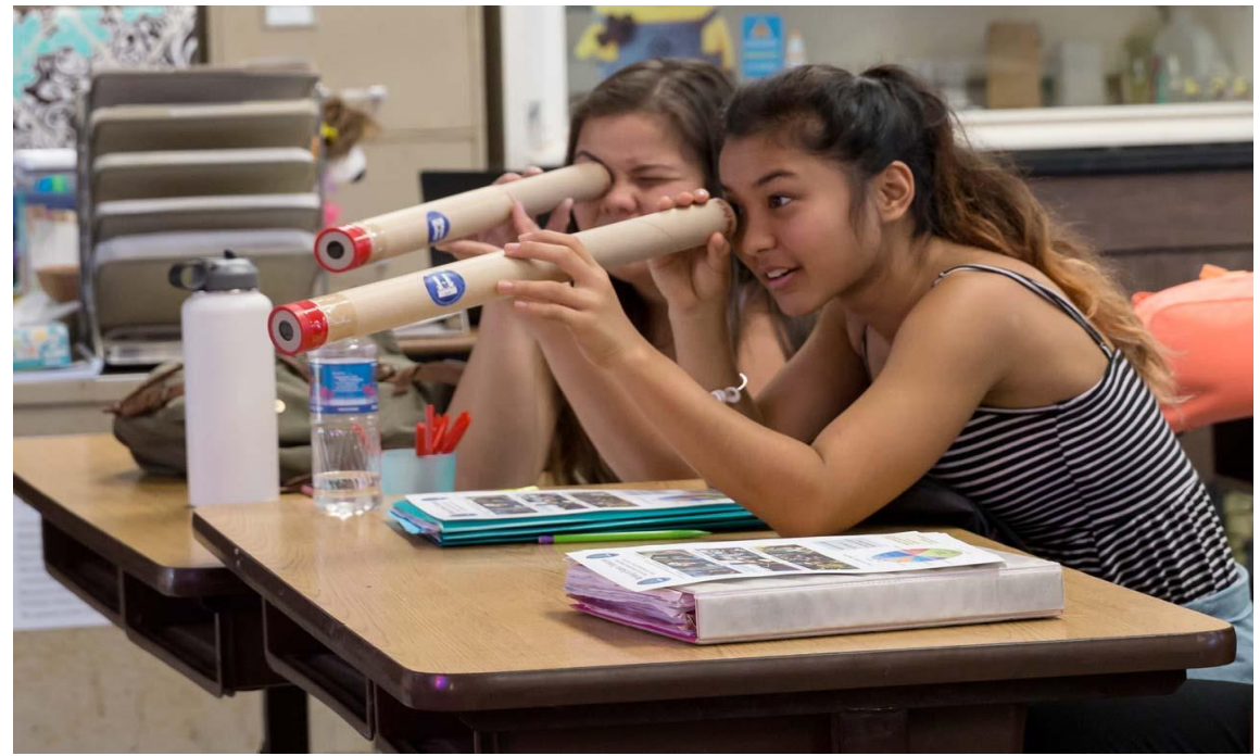
Students look through telescopes they built during a classroom visit.