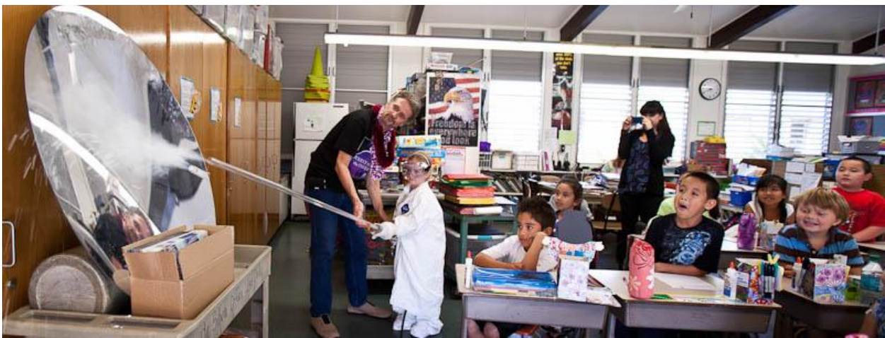
Students learn how telescope mirrors are cleaned during a classroom presentation.

The international Gemini collaboration provides access to two identical 8-meter telescopes. The Frederick C. Gillett Gemini telescope is located on Maunakea, Hawai'i (Gemini North) and the Gemini South telescope is on Cerro Pachón in central Chile; together the twin telescopes provide full coverage over both hemispheres of the sky. The telescopes incorporate technologies that allow large relatively thin mirrors, under active control, to collect and focus both visible and infrared radiation from space. The Observatory provides the astronomical communities in each of the five participating countries with state-of-the-art astronomical facilities that allocate observing time in proportion to each country's contribution. In addition to financial support, each country also contributes significant scientific and technical resources.